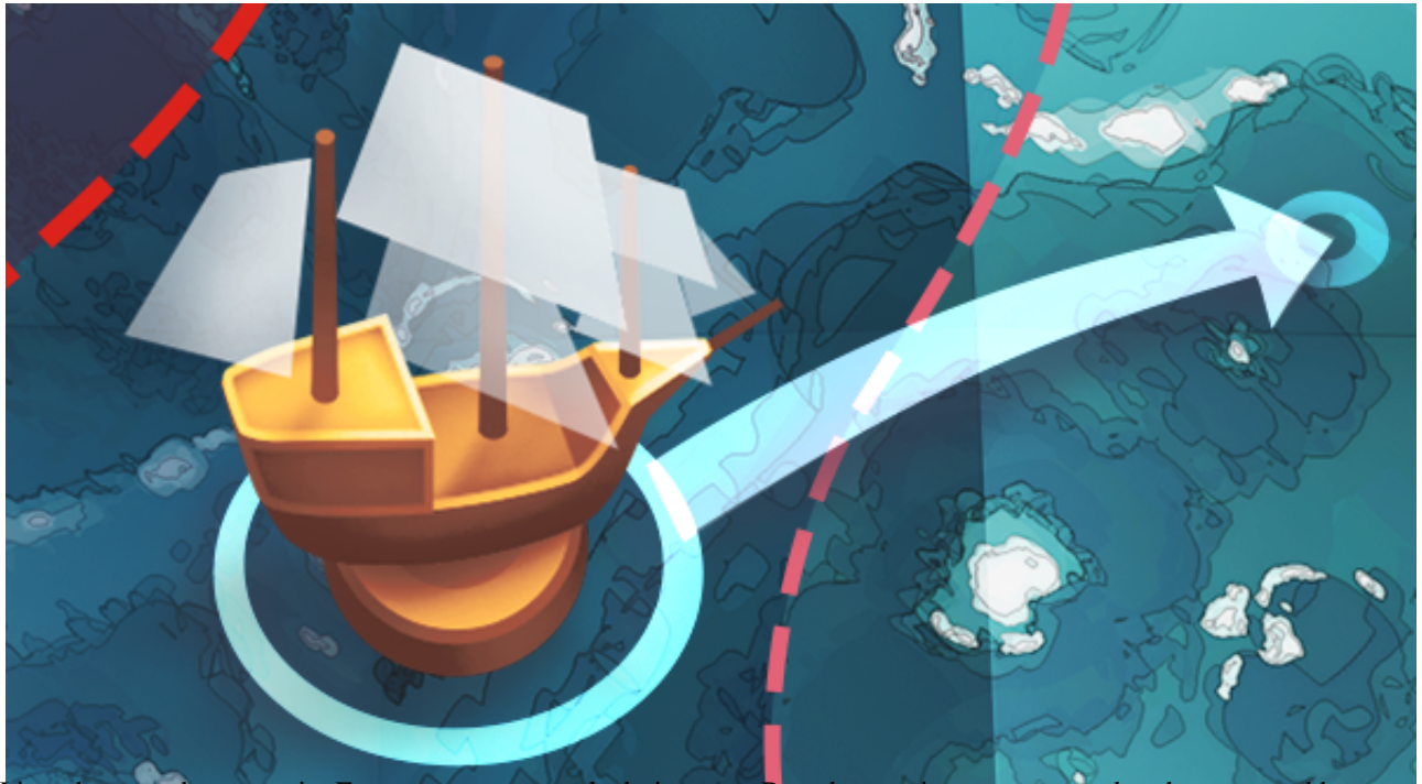
It's an honor to be a captain. Everyone respects and admires you. But when you're as poor as a church mouse and have no proper men, it's time to tighten your belt and take on the duties of the whole crew.

The ship is in danger. The enemy flagship is on your tail. Don't panic! You can always escape even before the battle started. But the captain's honor dictates to engage! If you lose, your ship will sink. But if you win, you can pick up the wreckage of an enemy ship and gold, and use them to improve your vessel.